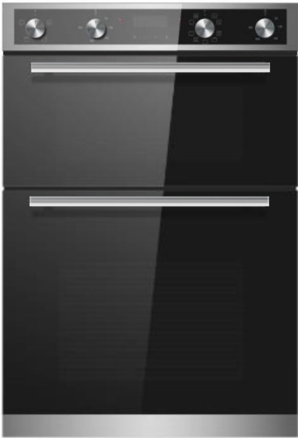
Image used is for indicative purposes only. Final product may differ.