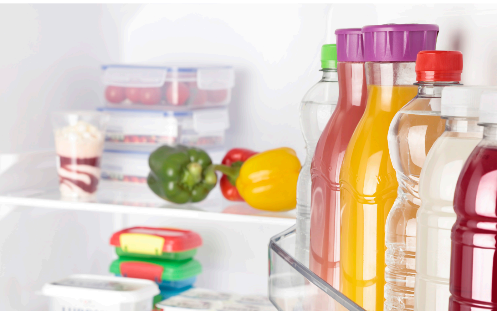
Table Top Retro Fridge MAB55 - Red / Black / Cream

Please read these instructions carefully before attempting to install or use this appliance. We recommend that you keep these instructions in a safe place for future reference.